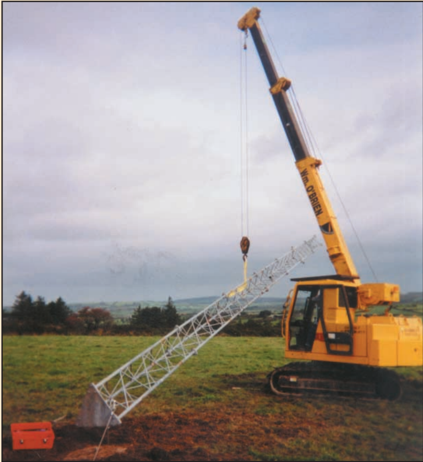
5 Ton IHI Crawler Crane with rubber tracks at work